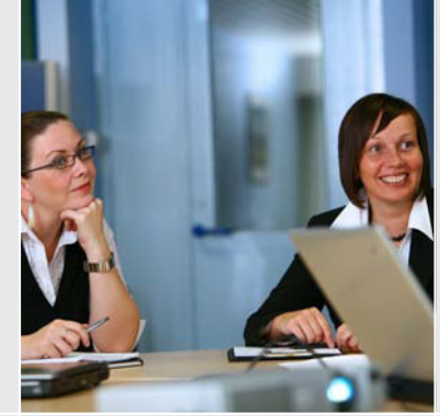
Experienced Professional Service