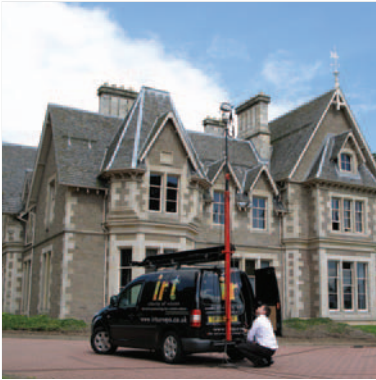
IRT Specialist vehicle with 17m mast